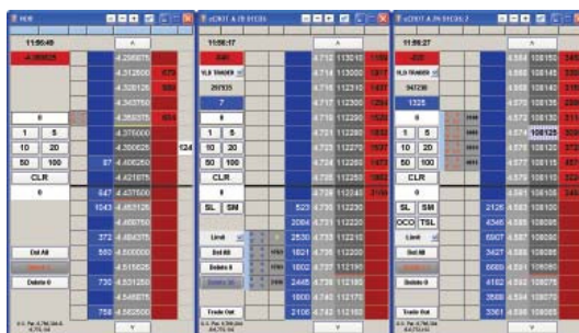
↑ Autospreeder® with Dynamic Settings Window and Treasury prices with yield AVAILABLE WITH X_TRADER® Pro